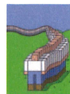
Cover illustration by Nick Little