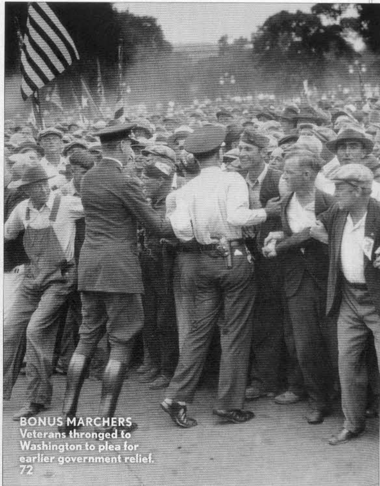
BONUS MARCHERS Veterans thronged to Washington to plea for earlier government relief. 72

In 1932, the U.S. Army disperses the protesters of the Bonus Expeditionary Force.